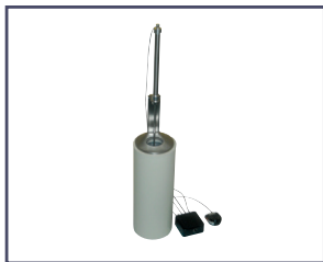
CAP-Lift: Item #5130-30251