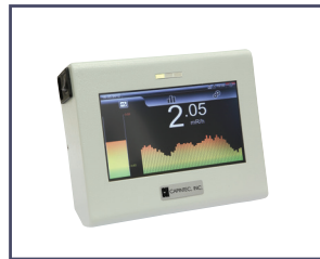
AreaExpert Digital Area Monitor: Item #5130-30251