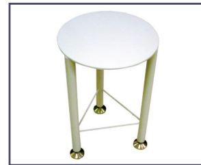
Positron Shield Stand: Item #5126-2001