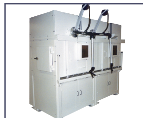
3 Part Sliding Door Hot Cell: Call for information