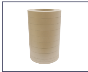
Positron Shield: Item #7300-2903