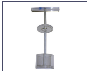
Custom Length Dipper: Item #5120-2258