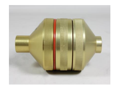
FJ-44 Aluminum In-Line