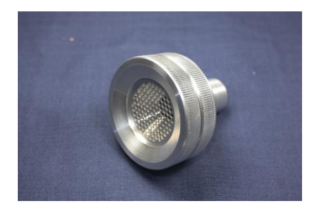
Aluminum Open-face Style

Filter Holder Types: Particulate Only • open face