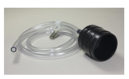
Lapel Filter Holders