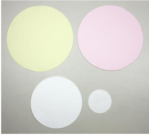
We carry Whatman, Ahlstrom and Millipore products