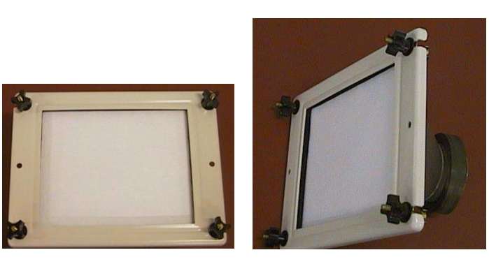
8" × 10" FJ2100