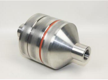
Stainless Steel In-Line Style