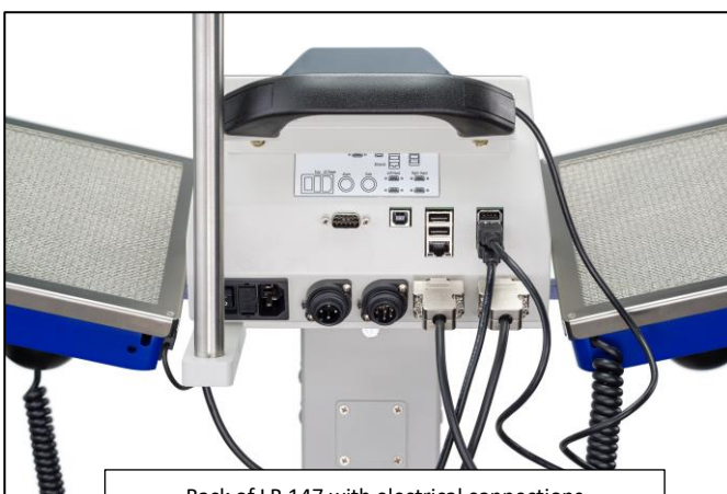
Back of LB 147 with electrical connections