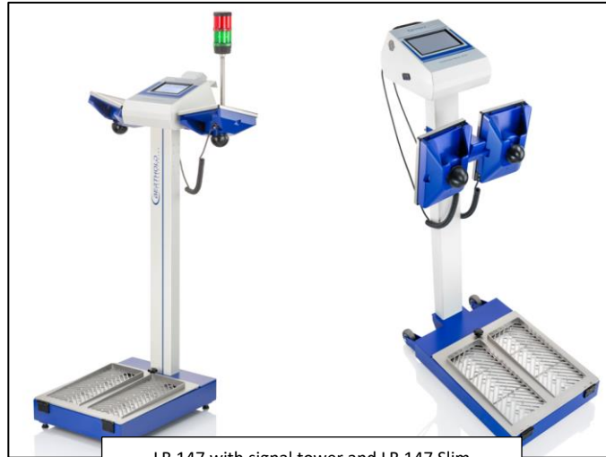
LB 147 with signal tower and LB 147 Slim

The built-in power supply adjusts automatically to the various alternating voltage supplies.