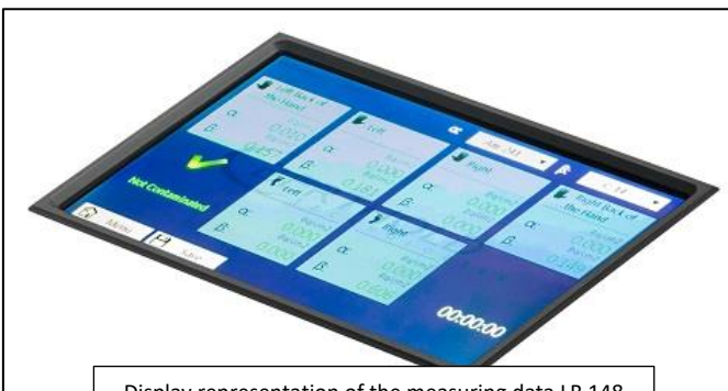
Display representation of the measuring data LB 148