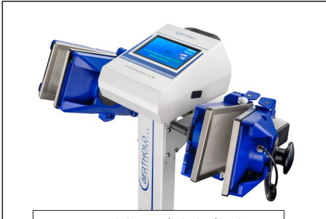
LB 148 with detectors for backs of hands

Reading measured data and performing software updates can be done very quickly via one of five USB (Host) ports.