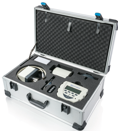
Figure 4: LB 201 Aluminium Transport Case