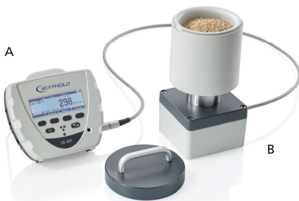
Figure 1: The Becquerel Monitor LB 201 for testing food samples in combination with a Marinelli sample cup. A: evaluation unit, B: detection unit

Thereby, the use of a Marinelli sample cup made of plastic ensures a consistent measuring geometry.