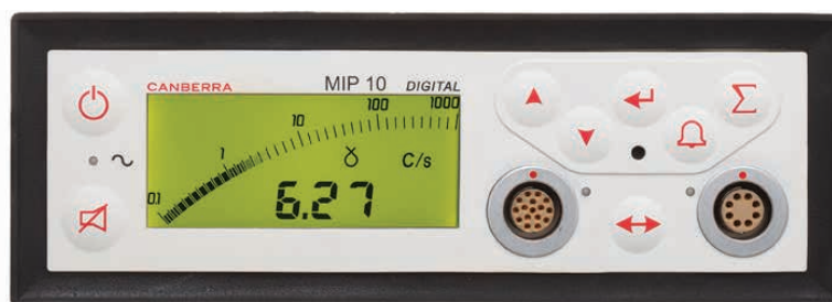
Figure 1: MIP 10 Digital front panel.

With high voltage and digitization of the data occurring in the probe rather than the instrument, measurement quality is no longer dependent on cable quality as with older analog systems. Also, the probes can be plugged in “hot” without powering down the survey meter – the instrument immediately recognizes the probe and automatically switches measurement mode to the mode required for that specific probe. Calibrations and QA measurements can also be performed directly with the probe, without even using the instrument, by connecting the probe to a computer with calibration software, allowing the MIP 10 Digital device to remain deployed in the field.