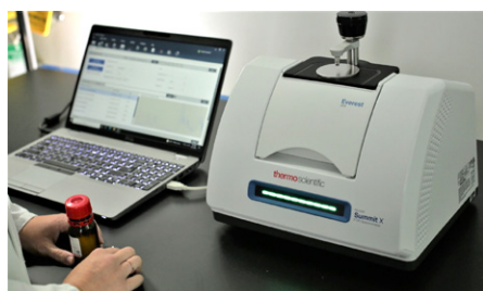
Figure 1. Nicolet Summit X FTIR Spectrometer with Everest Diamond ATR Accessory, powered by OMNIC Paradigm Software.