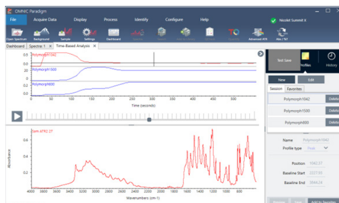
Figure 3. Time evolution of various peaks in the acetaminophen spectrum upon drying.

Although they consist of the same compound, polymorphs are known to crystallize into a variety of morphologies under differing physical conditions. The efficacy of pharmaceutical drugs depends strongly on their polymorphic form, making this a crucial aspect of NDA and patent application processes. In this study, a drop of acetaminophen was dissolved in ethanol and placed onto the Everest ATR Accessory. Time-based data collection with OMNIC Paradigm Software monitored the spectra as the ethanol evaporated. Initial spectra were dominated by the peaks of the ethanol solvent. After approximately 10 minutes of drying, the spectrum of dry acetaminophen was observed. Subsequently, the spectrum changed over the span of several minutes into a second form that then remained stable (Figure 3). This is due to a change in morphology caused by the drying process. Figure 3 shows the OMNIC Paradigm Software time-analysis window; the profile for each of the polymorphs observed in this study are shown on top, using characteristic peaks at 800, 1042, and 1500 \text{cm}^{-1} . The data indicates an increase in the peak intensity and stabilization for each of the polymorphic forms. The spectrum connected to polymorph ph1042 is shown at the bottom of Figure 3.