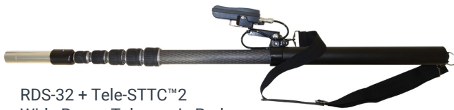
RDS-32 + Tele-STTC™2 Wide Range Telescopic Probe

* Change from GM tube to Si diode at 30 mSv/h in increasing field and back from Si diode to GM tube at 10 mSv/h in decreasing field