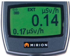
Display with Gamma Probe