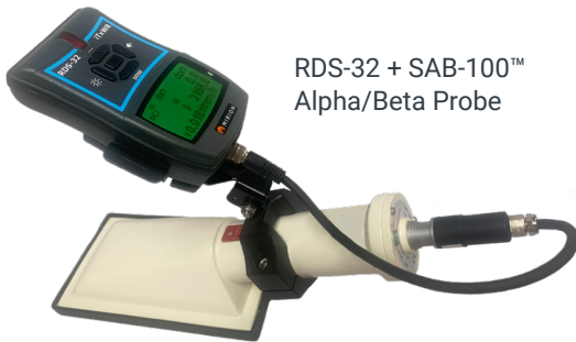
RDS-32 + SAB-100™ Alpha/Beta Probe