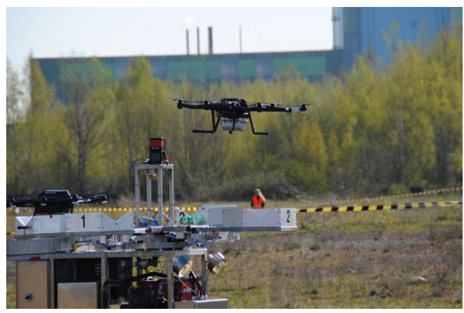
Drone landing on a platform and equipped with a SPIR-Explorer detector