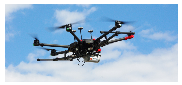
SPIR-Explorer Sensor in operation