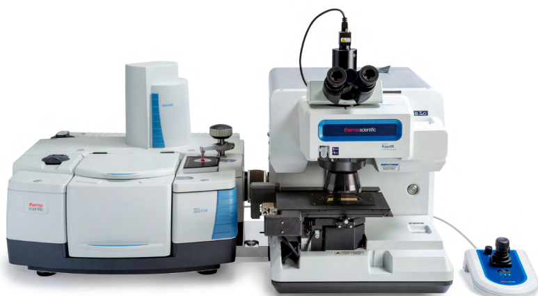
Nicolet RaptIR FTIR Microscope with the Thermo Scientific™ Nicolet™ iS50 FTIR Spectrometer

Finally, a report is created presenting results for each particle, including identification and size.