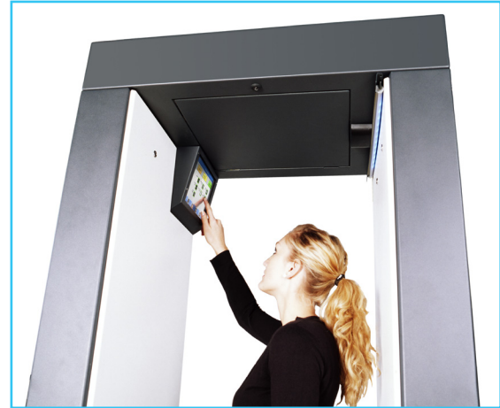
Fig. 1: Operating the FastTrack-Fibre monitor