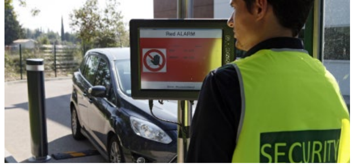
Double-sided SPIR-Ident Pedestrian monitor with green/red alert screen.