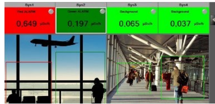
Local alarm station user interface for monitoring multiple lanes.